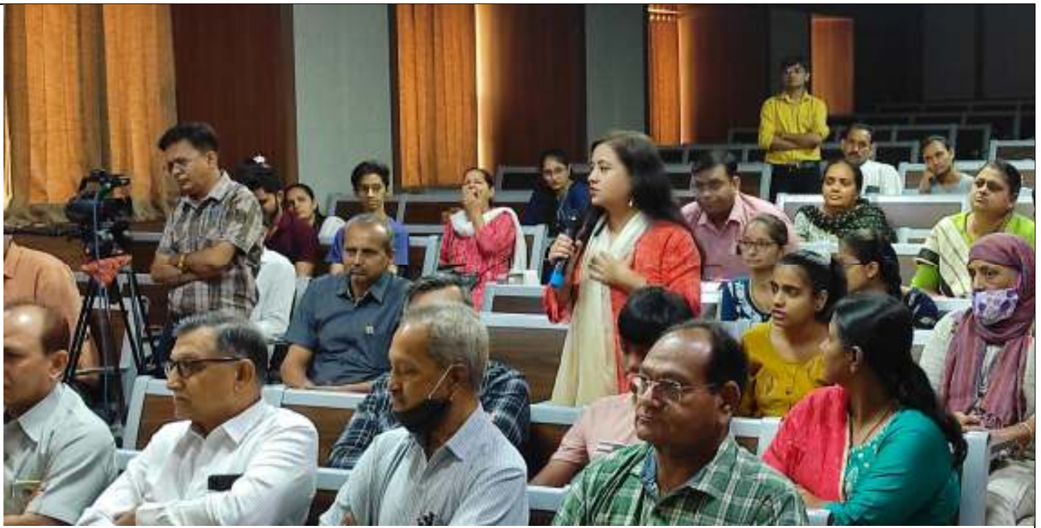
Parents Response on Student's sharing and Jeevan Vidya introduction session