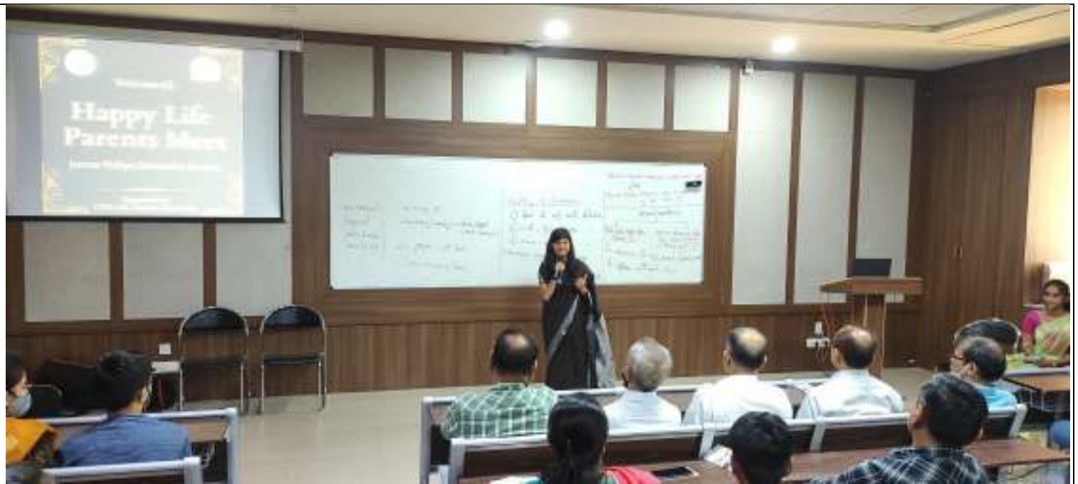
Feedback of Jeevan Vidya Shivir by AGI students