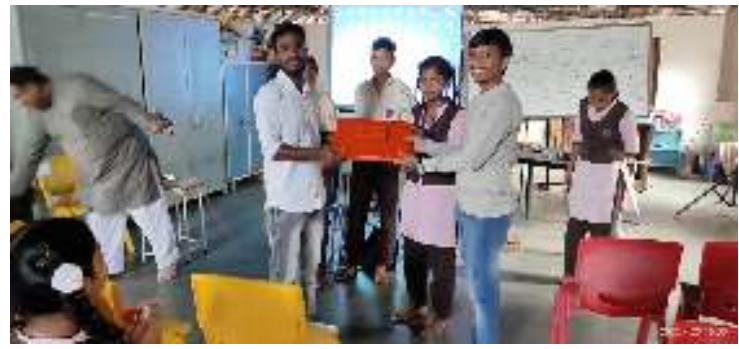
Glimpses of the Day-3 with feedback and valedictory function