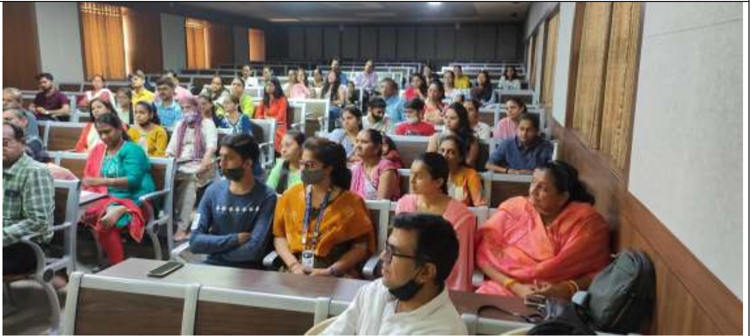
Participants from Society and AGI