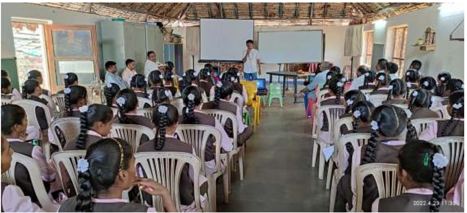
Glimpses of the Day-1