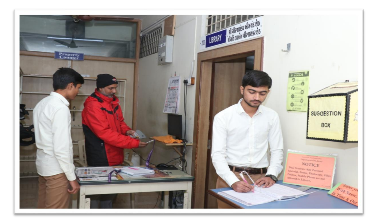
Figure 12: OPAC