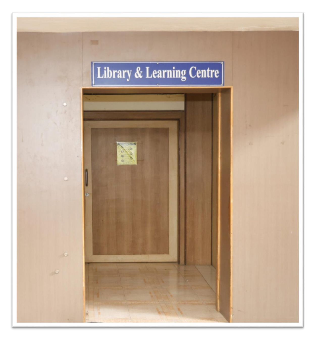
Figure 1: Library Entrance