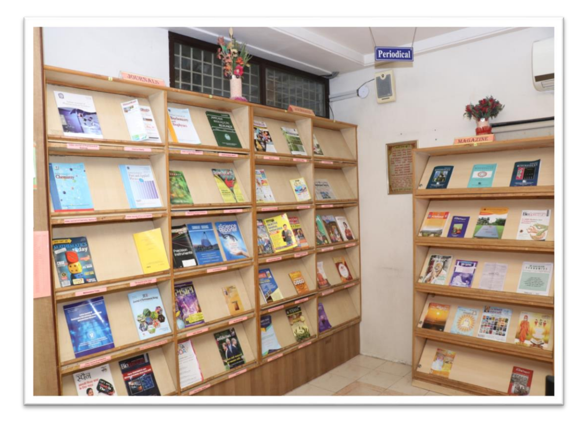
Figure 4: Journals