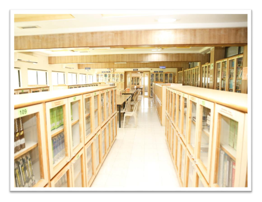
Figure 6: Dynamic Stack