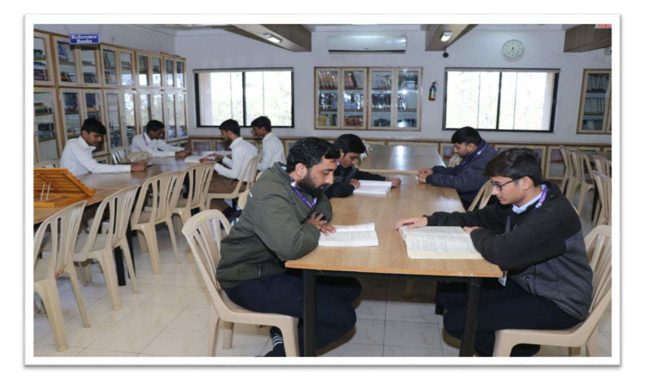
Figure 10: Reference Section