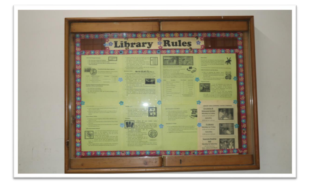
Figure 19: Library Rules Notice Board

Figure 20: Standard Operating Procedures (SOP) in Library and Reading Room