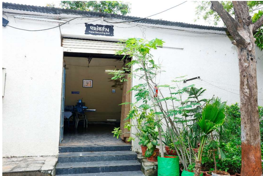
Campus Facility for Paper Waster Recycling